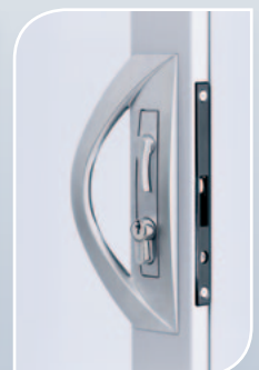
Available in all colours